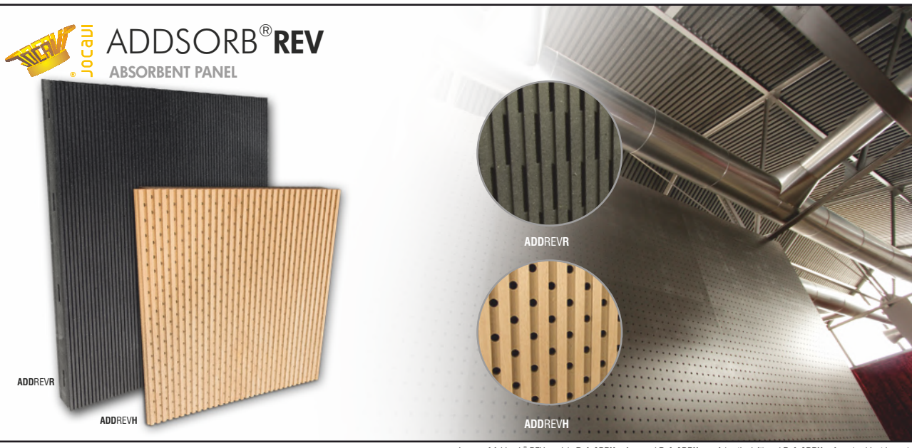
Image of Addsorb® REV models Ref.:ADRV colour and Ref.:ADRH wood (on the left) and Ref.:ADRH colour (ambient image).